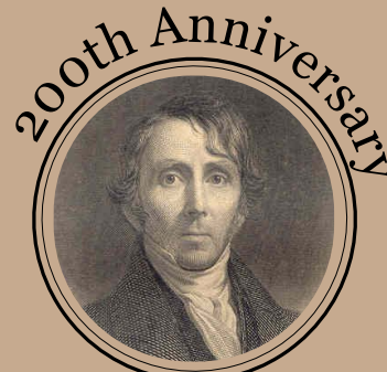
of Channing's sermon "Unitarian Christianity"