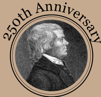
of John Murray's landing in America

October 17-20, 2019 at the Maritime Conference Center near Baltimore, Maryland